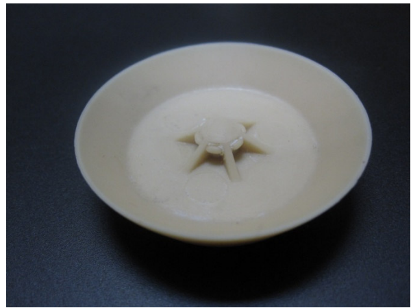
94102 Quick Dump Valve After 1 Dec 2011